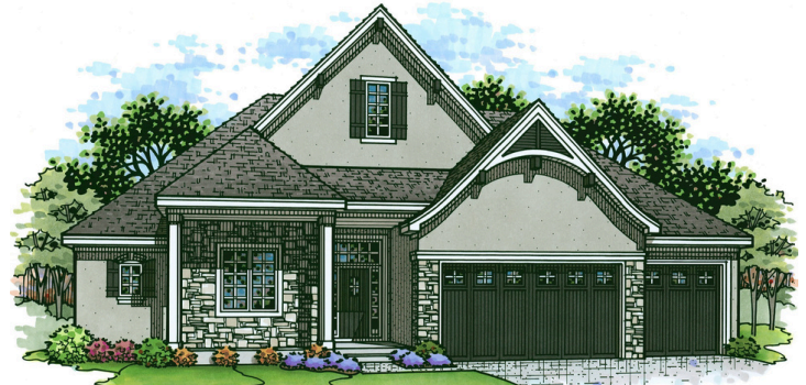
French Country with Front Porch