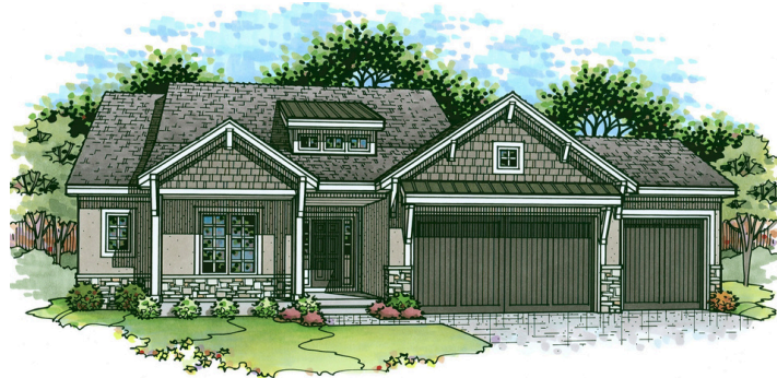
Craftsman with Front Porch