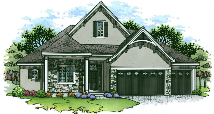
French Country with Front Porch